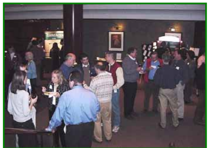
February 2007 Business Practices Forum with the Licensed Site Professional Association at the Westin Waltham-Boston Hotel in Waltham

To accomplish this Mission SWEP-MA will: Provide a forum to meet, share and discuss technical information and work experiences in the environmental professions; educate members on new developments and current trends in the environmental field; encourage and support members' involvement in leadership and mentoring; encourage and promote the development of business relationships; and encourage and promote public service in the environmental field.